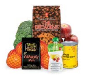
OUR CUSTOMERS SAY...

"I'm thankful for your low prices and that's why I choose your company. Your prices make a huge difference in a lot of lives. You make it so a single mom can afford food for the next week."