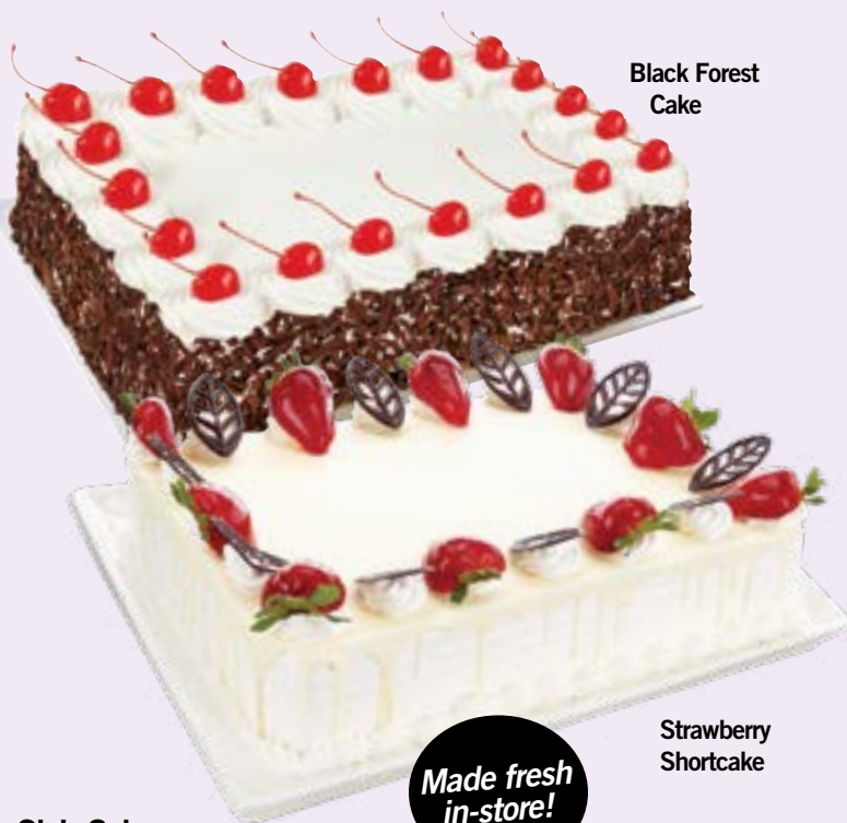
Black Forest Cake